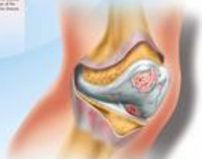
Knee joint with signs of arthritis. The damage to the joint cartilage of the knee can be clearly seen. The joint space is narrowed and the bony outgrowths have developed at the edges of the tibia ("spurring").

Regenerative joint disease (osteoarthritis) Regenerative joint disease (osteoarthritis) is a degenerative disease of the joints. It is characterized by the formation of bony bridges between the vertebrae. The disease is characterized by a long period of remission, followed by a relapse. The disease is characterized by a long period of remission, followed by a relapse.